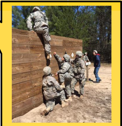
Golden Eagle Battalion